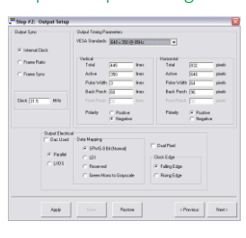
Step 2: Output timing

Sets up the output timing and electrical definitions