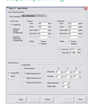
Step1: Input timing

Sets up the input timing and electrical definitions